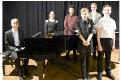
RECENT WINNERS AND RUNNERS-UP